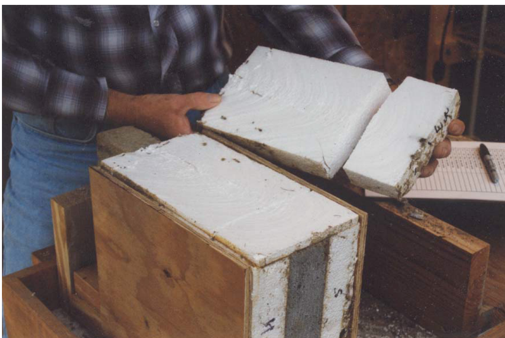
#64 TEST FIXTURE - Close-up shows slight termite damage.