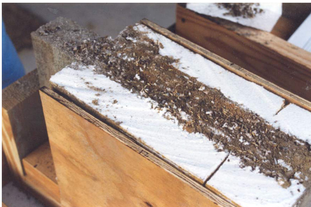
#45 TEST FIXTURE - Close-up shows active termites.