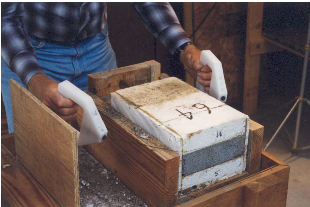
#64 TEST FIXTURE - Examination of ThermaFoam with Perform Guard after 3 years exposure. Highland site, Mississippi.