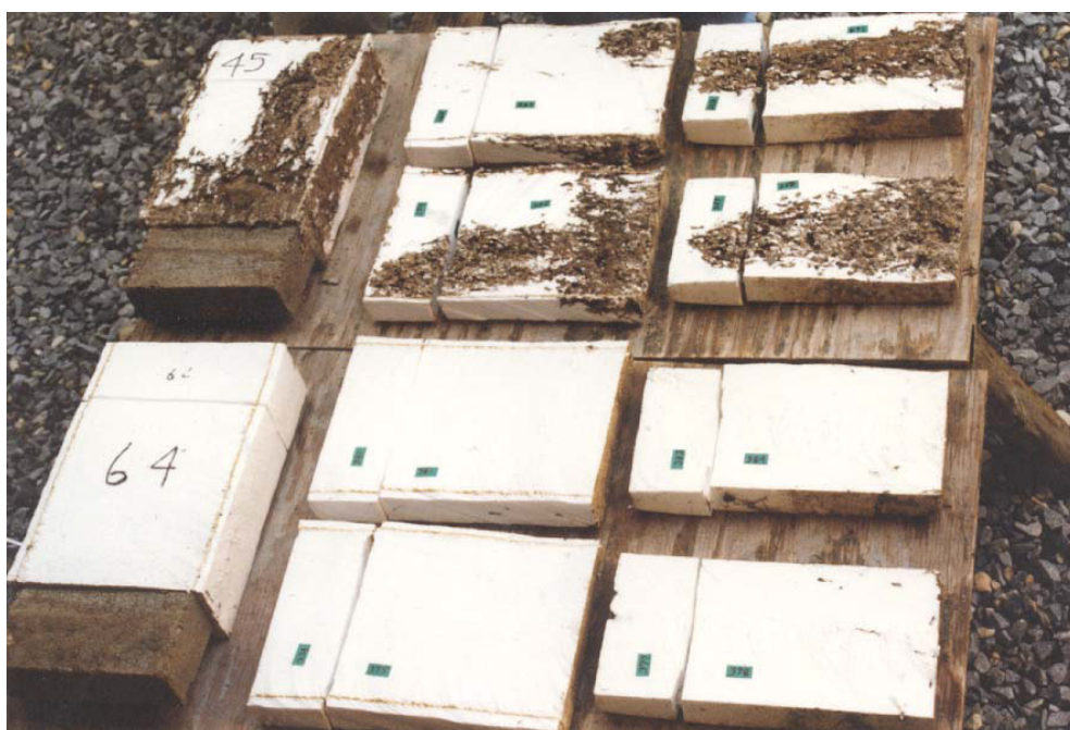
#64 and #45 TEST FIXTURES - Close-up comparison.