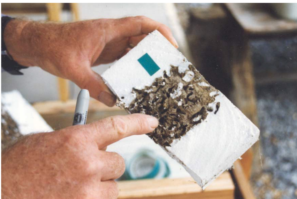
#45 TEST FIXTURE - Close-up shows termite nesting galleries formed in non-treated EPS.