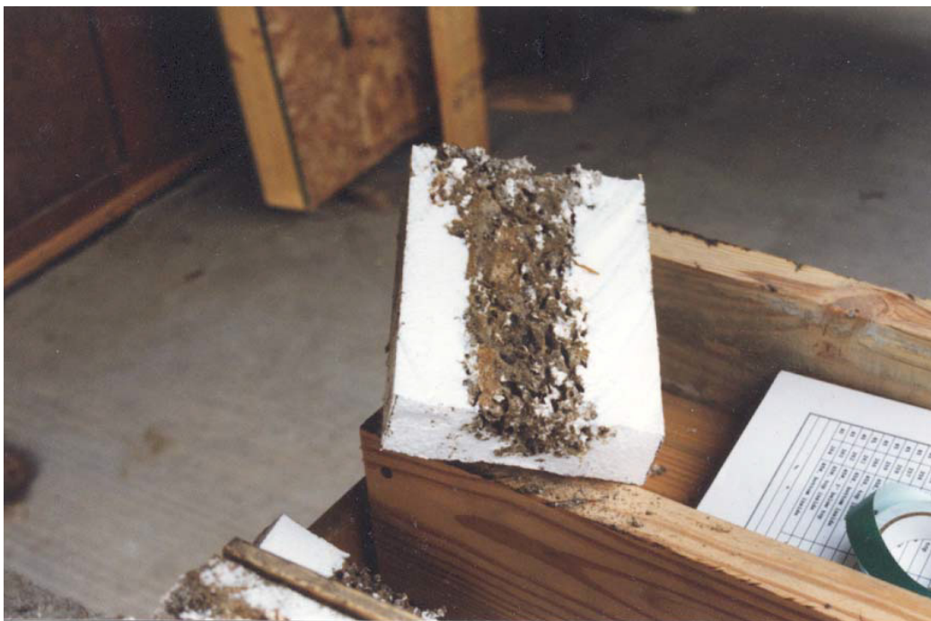
#45 TEST FIXTURE - Close-up shows nesting infestation of termites.